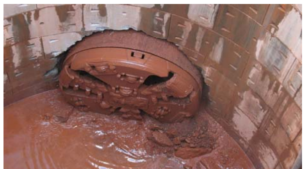
TBM emerging from tunnel drive into the reception shaft at Powderham